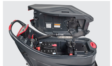
Recovery tank with hand grip for easy tilting