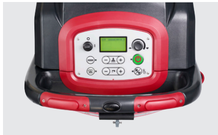
Intuitive control panel with LCD screen for all models (AS6690T/AS7690T pictured)