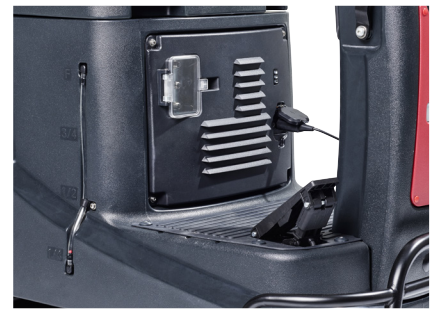
USB-port for fast charging of tablets and cell phones