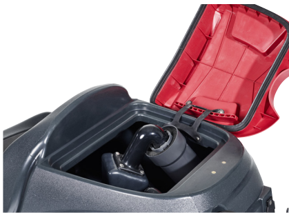
Large opening to the 73 liter recovery tank allows for easy cleaning