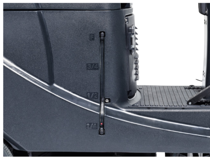
Water solution indicator with volume visible on the tank